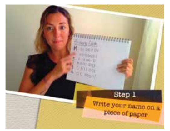
An episode of LitWorld's Virtual LitClubs