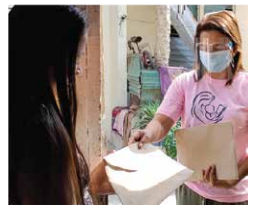
LitMoms delivering LitKits at Project PEARLS, Philippines