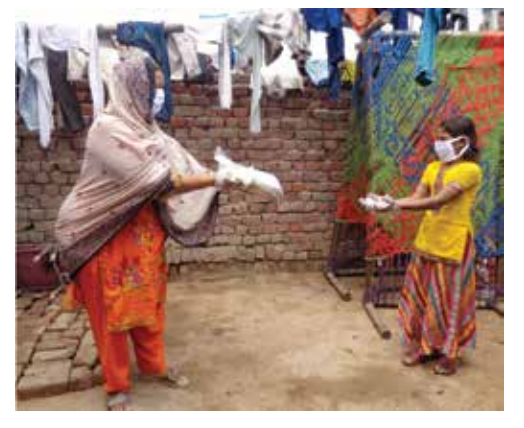
Mentors & LitKids distributing food at Seeds of Hope, Pakistan