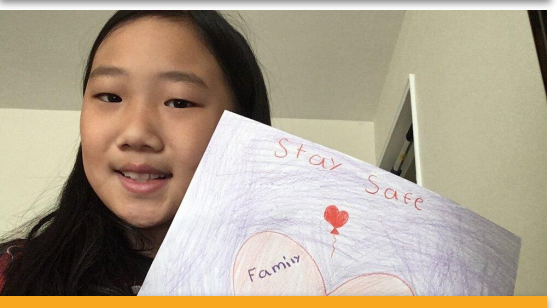
A #GlobalHeartMap submission