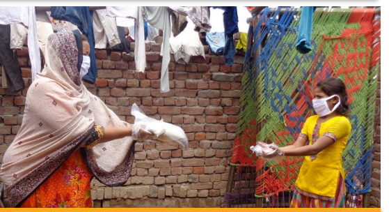
Food distribution in Pakistan