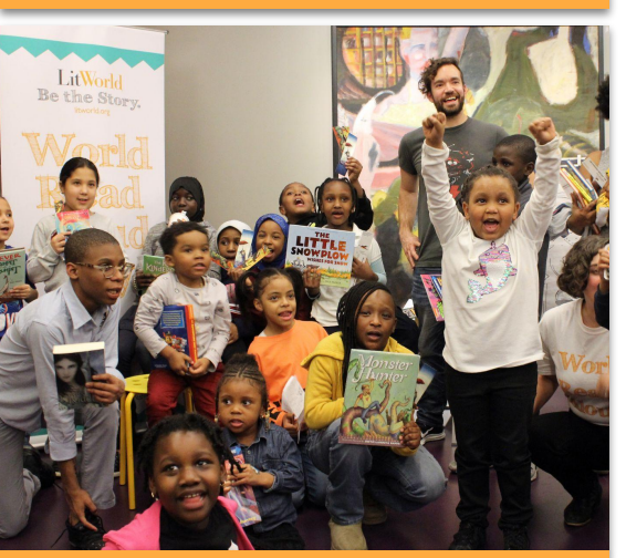
WR AD celebrations at BHC