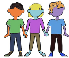
Community Building Activity