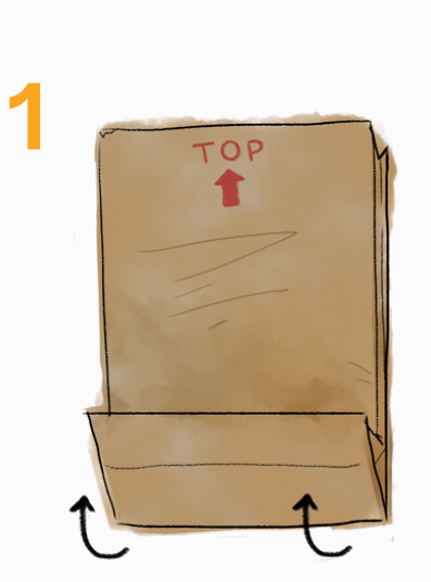
At the closed end of the bag, fold the loose flap flat against the bag's bottom

One way of making a Reading Crown is by using a brown paper bag. Follow the instructions below to make your own World Read Aloud Day Reading Crown the special LitWorld® way!