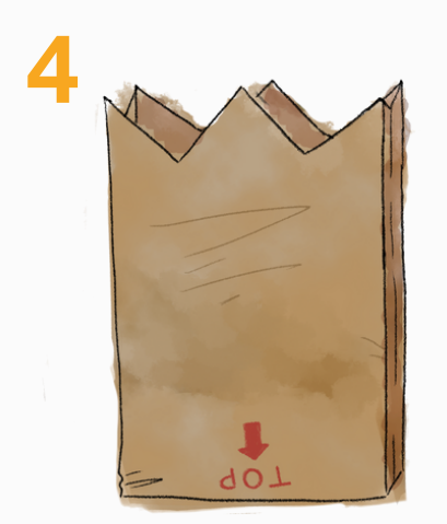
Open the bag. One end should now have the spikes of the crown