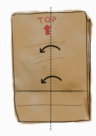
Now, fold the entire bag in half vertically (length-wise)